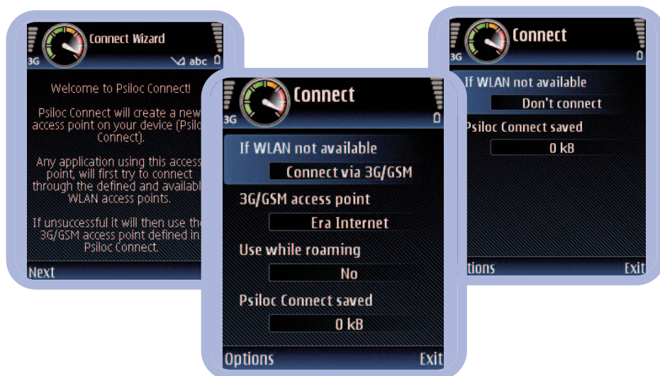
Psiloc Connect provides seamless switching between WLAN and operator data connections. It also offers the option of use while roaming.

When a WLAN is available for use, why use up units of 3G, EDGE, or other operator data connectivity? On the other hand, who wants to be constantly setting and resetting their mobile phones to adapt to the most cost-efficient and/or fastest line available? 'Switching seamlessly between data connectivity sources should be the job of an intelligent piece of software, and that is why we created Psiloc Connect', says Wojciech Nowanski, chief operating officer (COO) of Psiloc, a company based in Warsaw, Poland. 'Psiloc Connect has a smart roaming setting to minimize your data charges when you are abroad.'