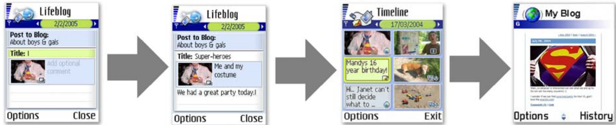
Figure 4. Nokia Lifeblog is an appealing, optimized, and usable way to post to blogs

Post editor after selecting the content to post