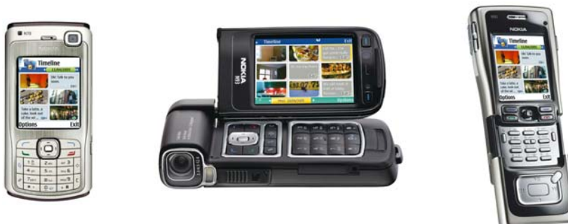
Figure 2. Nokia Lifeblog is part of the unique offering of all Nokia Nseries devices

Nokia Lifeblog is currently compatible with Nokia 3230, Nokia 6260, Nokia 6630, Nokia 6670, Nokia 6680, Nokia 6681, Nokia 6682, and Nokia 7610 phones, and Nokia Lifeblog 2.0 is compatible with all Nokia Nseries devices.