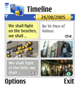
Figure 1. Nokia Lifeblog – your multimedia diary

Nokia Lifeblog on compatible mobile phones collects a timeline of pictures, videos, and text messages without any effort. The user can browse the content as they would a diary, add text notes, or share content straight from the application on the device.