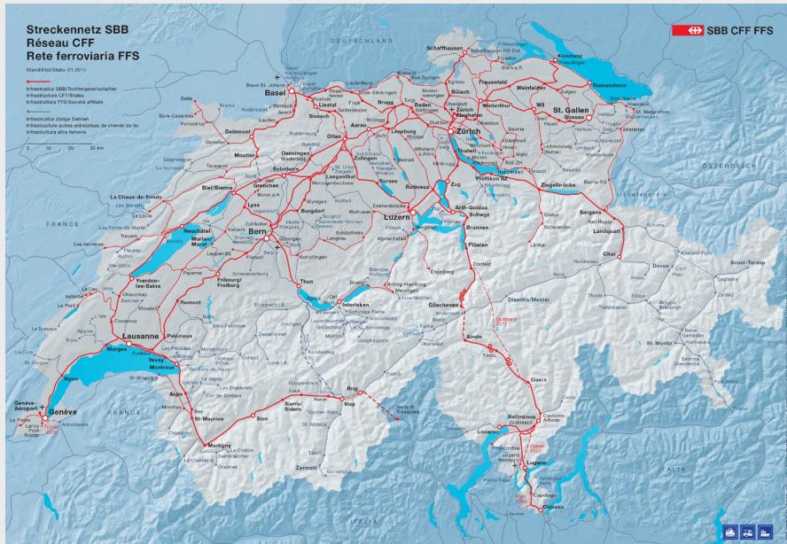
Figure 1. Nationwide SBB railways network

“This new nationwide next-generation network will increase our data capacity significantly and at the same time provide an enhanced availability. We’re laying the foundation for an increasingly interconnected and digitized future.”