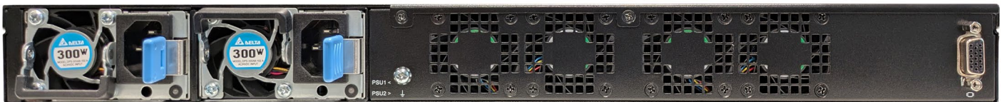
Back panel view