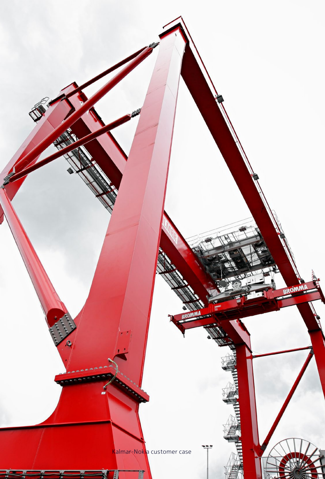
Kalmar-Nokia customer case