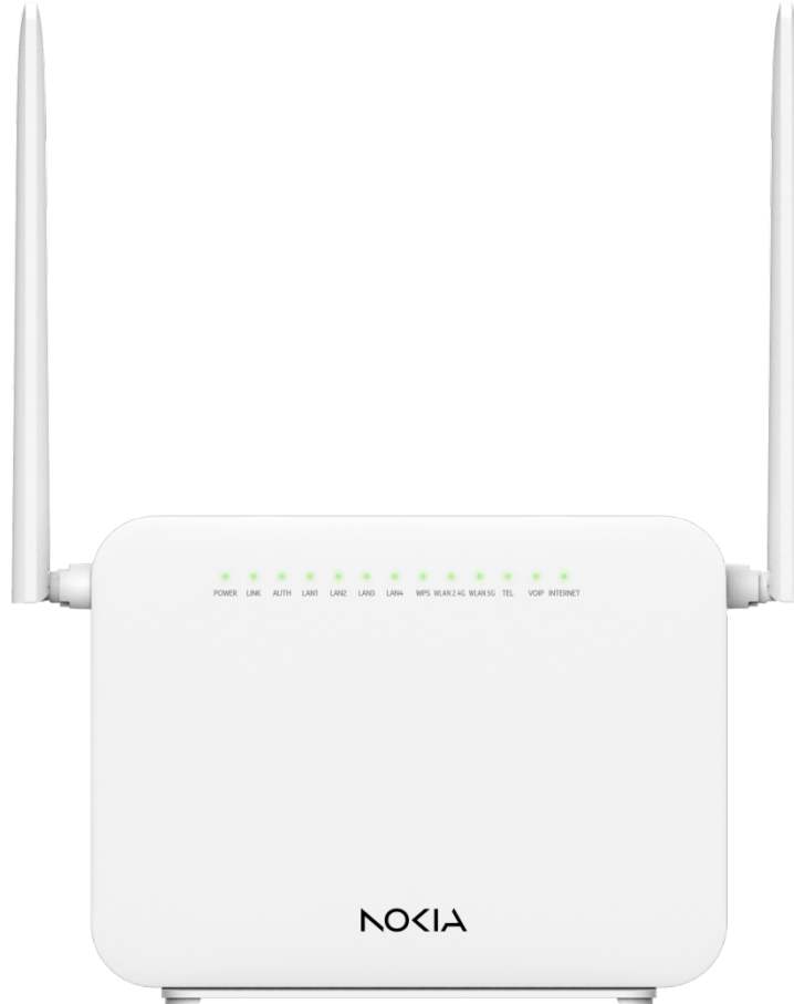
Figure 1: Nokia ONT G-1425G-E front view

The Nokia optical network terminal (ONT) G-1425G-E is the solution for home networking that is delivered by Gigabit Passive Optical Network (GPON). The device has built-in concurrent dual-band Wi-Fi® 802.11b/g/n and 802.11ac networking for high-capacity Wi-Fi connectivity. This coverage can be expanded at any time by installing additional Wi-Fi EasyMesh-capable beacons to ensure seamless roaming throughout the home. The G-1425G-E includes the Nokia WiFi Mesh Middleware which ensures the best possible Wi-Fi performance. The end-user experience is enhanced by the intuitive Nokia WiFi Mobile App and by the service provider's Wi-Fi management capabilities in the cloud