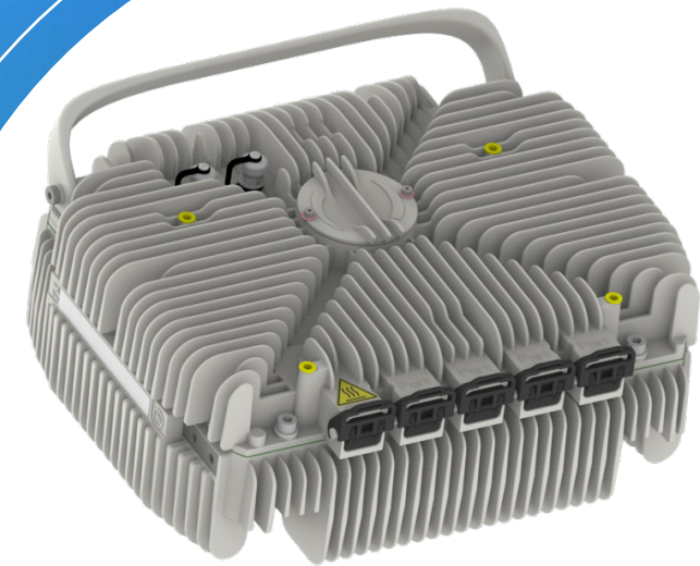
Wavence UBT-T XP microwave provides the highest output power and system gain in the market

By providing the necessary power, system gain and reliability, Nokia's microwave technology enabled operator to overcome environmental obstacles and deliver robust communication links.