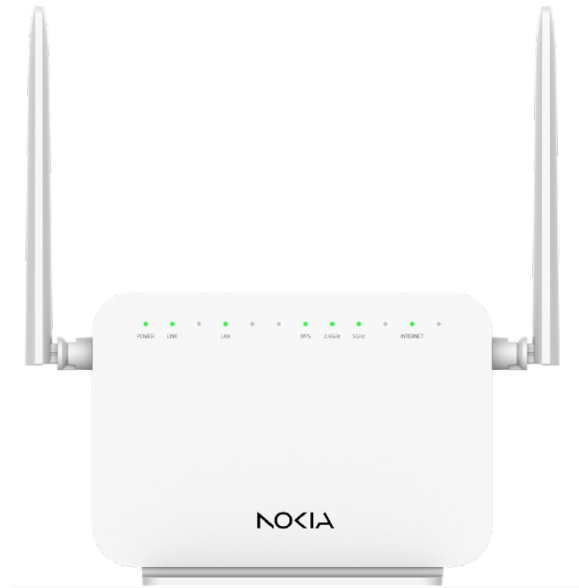
Figure 1: Nokia ONT G-0126G-A (front)

The G-0126G-A also supports application containers, that allow the introduction of new services, from cybersecurity to entertainment to productivity.