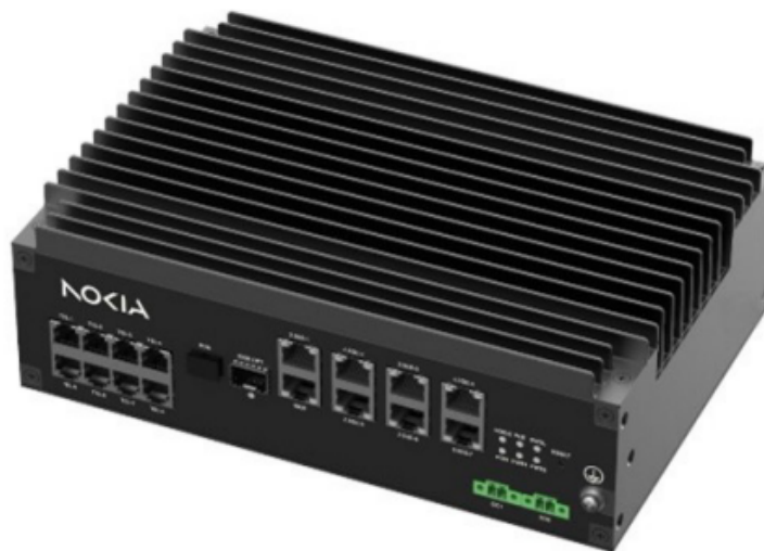
Figure 1 Nokia ONT U-880XP-P

The ONT is compliant with ITU-T G.9807.1 and with standard OMCI definition. The device can be managed from a remote site.