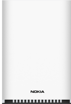
Figure 1 Nokia Beacon 1.1 (front)

The Nokia Beacon 1.1 extends the whole home WiFi experience for broadband subscribers. It supports 2x2 MIMO on both the 2.4 GHz and 5 GHz bands, with maximum theoretical speeds of 300 Mbps and 867 Mbps, respectively. When no dedicated gateway is in the network, this Beacon will take the role of a wireless router with access to the broadband network.