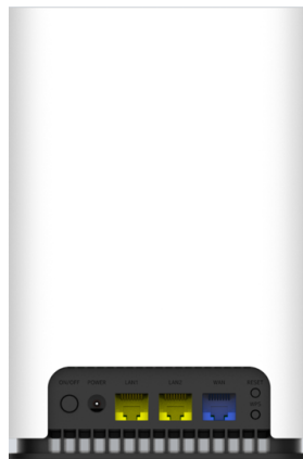
Figure 2 Nokia Beacon 1.1 (back)