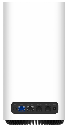
Figure 2 Nokia Beacon 19 (back)