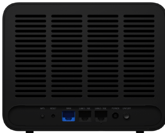
Figure 2 Nokia WiFi Beacon 3.3 back view

© 2026 Nokia. Nokia Confidential Information. Use subject to agreed restrictions on disclosure and use.