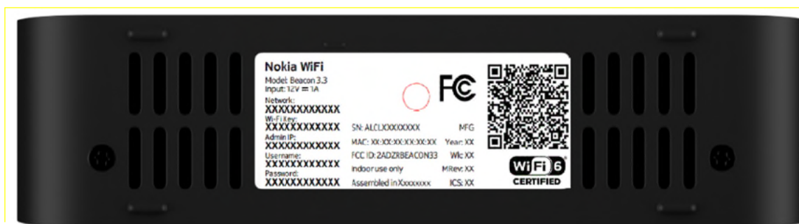
Figure 3 Nokia WiFi Beacon 3.3 bottom view