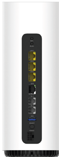
Figure 2 Nokia ONT XS-2426X-A back view