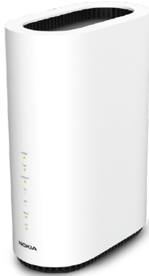
Figure 1 Nokia ONT XS-2426X-A front view

The Nokia ONT XS-2426X-A is the solution for home networking that is delivered by 10 Gigabit symmetrical Passive Optical Network (XGS-PON). The device has built-in concurrent dual-band Wi-Fi® 802.11 b/g/n/ax and 802.11a/n/ac/ax networking with triple play capabilities that include voice, video and data. The XS-2426X-A supports Wi-Fi EasyMesh™, to create a whole home mesh network. This coverage can be expanded at any time by installing additional Wi-Fi EasyMesh-capable beacons to ensure seamless roaming throughout the home. The XS-2426X-A includes the Nokia WiFi Mesh Middleware which ensures the best possible Wi-Fi performance. The end-user experience is enhanced by the service provider's Wi-Fi management capabilities in the cloud and intuitive home user support using the Nokia WiFi mobile app. The XS-2426X-A also supports application containers, that allow introducing new services, from cybersecurity to entertainment to productivity.