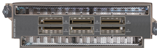
6-connector CFP2-DCO MDA-se