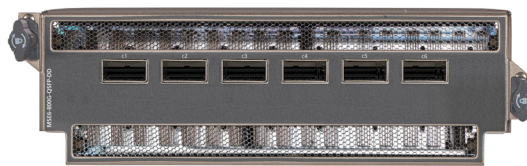
6-connector 800G QSFP-DD MDA-se