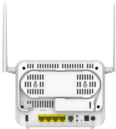
Figure 2 Nokia ONT G-1425G-H (back)