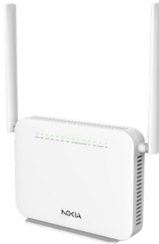
Figure 1 Nokia ONT G-1425G-H (front)

This Nokia indoor ONT is designed to deliver triple play services (voice, video and data) to residential subscribers and optionally can be managed by the Nokia Home Controller. The Home Controller gives help desk agents a real-time holistic view of the in-home network to assist them with easy identification and instantaneous resolution of issues. For the network administrators, it provides an end-to-end Wi-Fi network view and allows management of groups of Wi-Fi networks.