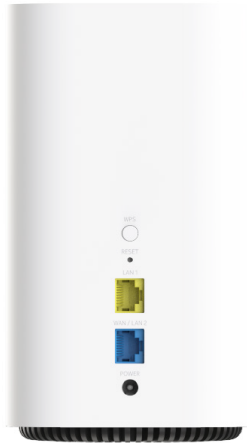
Figure 2 Nokia Beacon 2 (back)