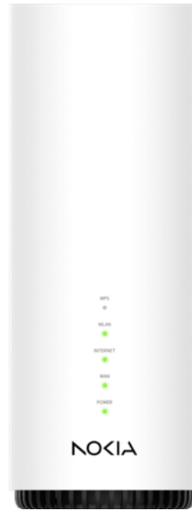
Figure 1:Nokia WiFi Beacon G6 front view

The Nokia WiFi Beacon G6 extends the whole home Wi-Fi experience for broadband subscribers. This premium class Beacon Gateway supports Wi-Fi 6 and Wi-Fi EasyMesh™, to create a whole home coverage mesh network backhauled by wired Ethernet or Wi-Fi. This coverage can be expanded at any time by installing additional Nokia WiFi Beacon 2 units to ensure seamless roaming throughout the home. The Nokia WiFi Beacon G6 is a dual-band Wi-Fi 6 mesh system with Wi-Fi Alliance (WFA) certified Wi-Fi EasyMesh, enhanced by Nokia value added features.