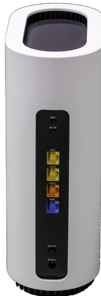
Figure 2:Nokia WiFi Beacon G6 back view

© 2025 Nokia. Nokia Confidential Information. Use subject to agreed restrictions on disclosure and use.