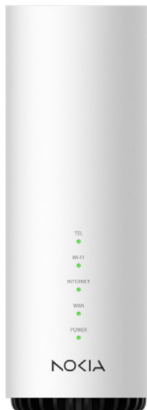
Figure 1 Nokia WiFi Beacon G3.1 (front)

The Nokia WiFi Beacon G3.1 extends the whole home Wi-Fi experience for broadband subscribers. The Beacon supports Wi-Fi 6 and Wi-Fi EasyMesh™, to create a whole home coverage mesh network backhauled by wired Ethernet or Wi-Fi.