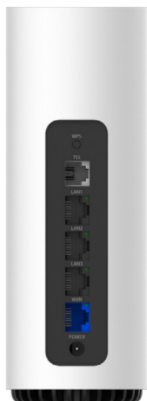
Figure 2 Nokia WiFi Beacon G3.1 (back)

© 2025 Nokia. Nokia Confidential Information. Use subject to agreed restrictions on disclosure and use.