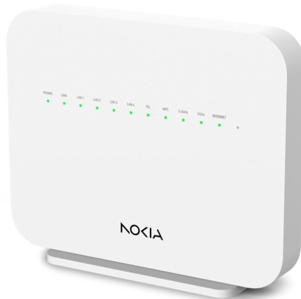
Figure 1 Nokia ONT G-1427G-A front view

The Nokia ONT G-1427G-A is the solution for home networking that is delivered by Gigabit Passive Optical Network (GPON). The device has built-in concurrent dual-band Wi-Fi® 7 networking with triple play capabilities that include voice, video and data. The G-1427G-A supports Wi-Fi EasyMesh™, to create a whole home mesh network. This coverage can be expanded at any time by installing additional Wi-Fi EasyMesh-capable Beacons to ensure seamless roaming throughout the home.